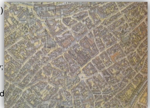
Goslar Old Town

19:30 - 22:00 Departure by bus for Gala Dinner at antik "Brusttuch"-Restaurant, one of oldest (1527) timber framed medieval houses in Goslar ( www.brusttuch.de ) (Brusttuch = Bra-ssiere(?!))