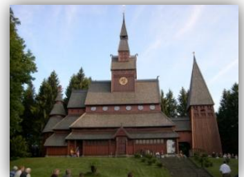
Stabkirche in Hahnenklee

20:00 Uhr „Chapter-Business Meeting“ (Hotel conference room)